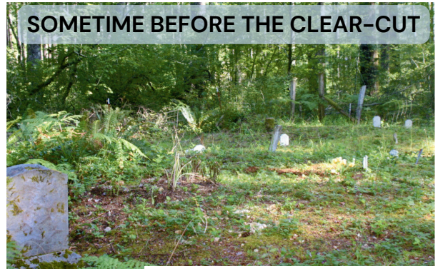
SOMETIME BEFORE THE CLEAR-CUT

While this kind of work isn't for everyone, perhaps some BCGS members might be interested in doing this type of service project together in the future? ~ LJC