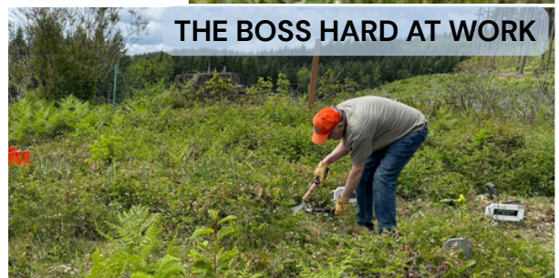
THE BOSS HARD AT WORK