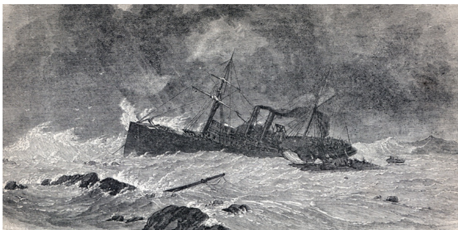
"Wreck of the S.S. Golden Rule, Caribbean Sea, May 30, 1865, artist's impression," House Divided: The Civil War Research Engine at Dickinson College, https://hd.housedivided.dickinson.edu/node/44142 . (Artist's representation of a sketch by a passenger.)

The sailors used two small boats and a makeshift raft to ferry the more than 600 passengers and crew to a nearby barren island where they were stranded for 11 days. The