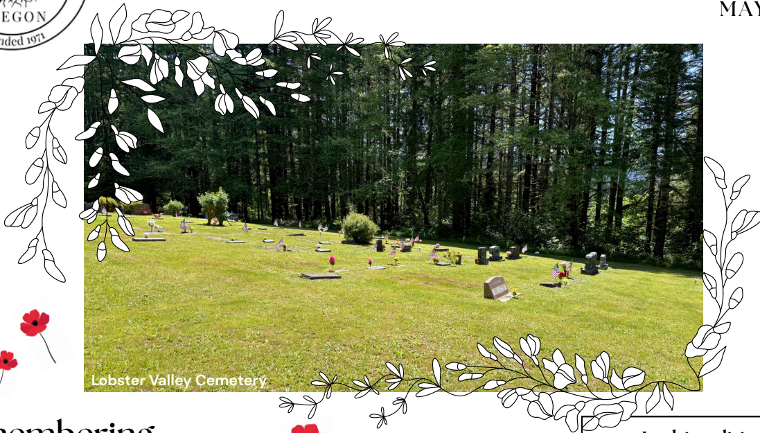
Lobster Valley Cemetery