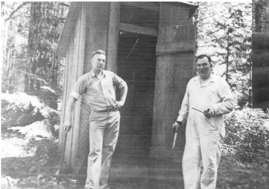
First project was the outhouse.