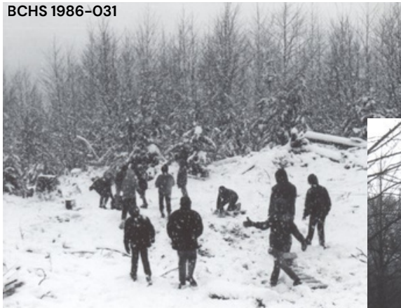
Boy Scouts, circa 1968