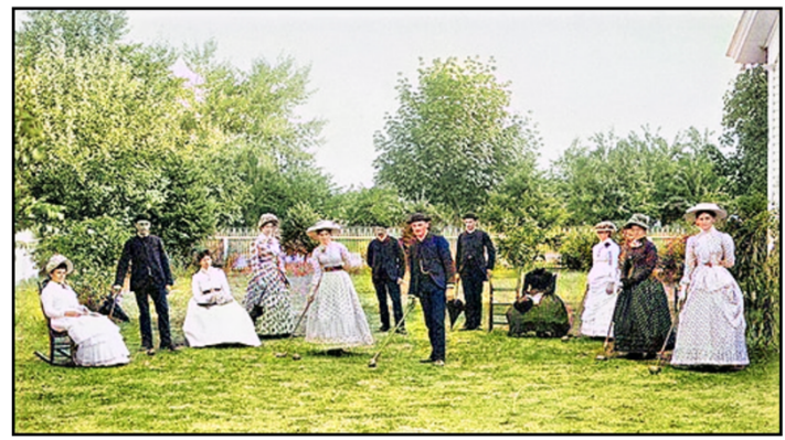
Croquet in Corvallis circa 1885

The Oregon GenWeb covers the whole of Oregon counties with history and genealogy. It was sad when the other GenWeb stopped working. It's nice to have it back.