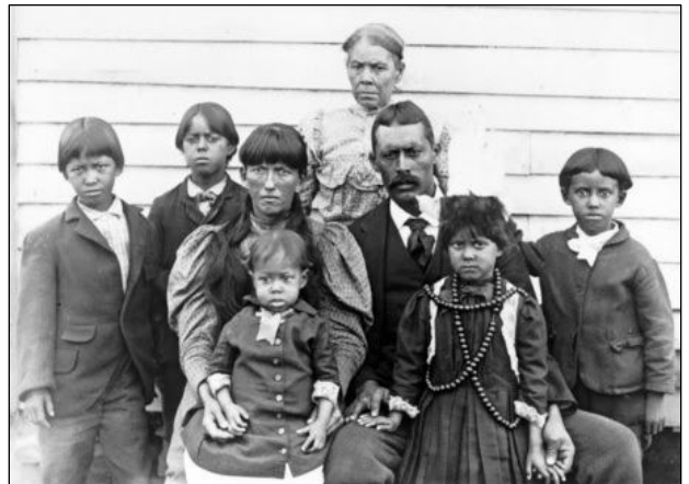
A Melungeon family in the early 20th century

"Wikipedia states, Melungeons is a term for numerous tri-racial isolate group of people of the Southeastern United States. Historically, the Melungeons were associated with settlements in the Cumberland Gap area of central Appalachia, which includes portions of East Tennessee, Southwest Virginia, and eastern Kentucky. Tri-racial describes populations thought to be of mixed European, African and Native American ancestry. Although there is no consensus on how many such groups exist, estimates range as high as 200."