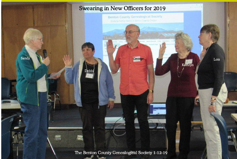
The Benton County Genealogical Society 1-12-19