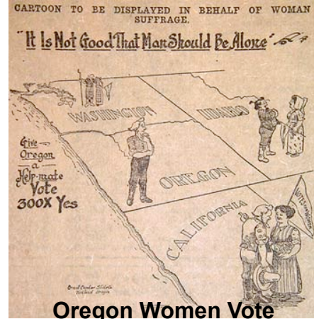
Oregon Women Vote 1912 - 2012

General Meetings are held on the second Saturday, September through June, in the Social Hall of the College United Methodist Church, 1123 Main St., Philomath, OR. Everyone is welcome. Business: 10:00 AM - 10:45 AM Program : 11:00 AM - 12:00 PM