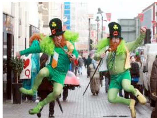
Happy St. Patrick's Day

General Meetings are held on the second Saturday, September through June, in the Social Hall of the College United Methodist Church, 1123 Main St., Philomath OR. Everyone is welcome. Business: 10:00 AM - 10:45 AM Program : 11:00 AM - 12:00 PM