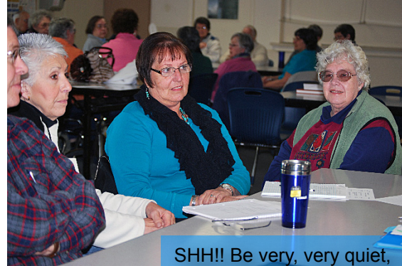
SHH!! Be very, very quiet, I'm hunting forebears

Business: 10:00 AM - 10:45 AM Program : 11:00 AM - 12:00 PM