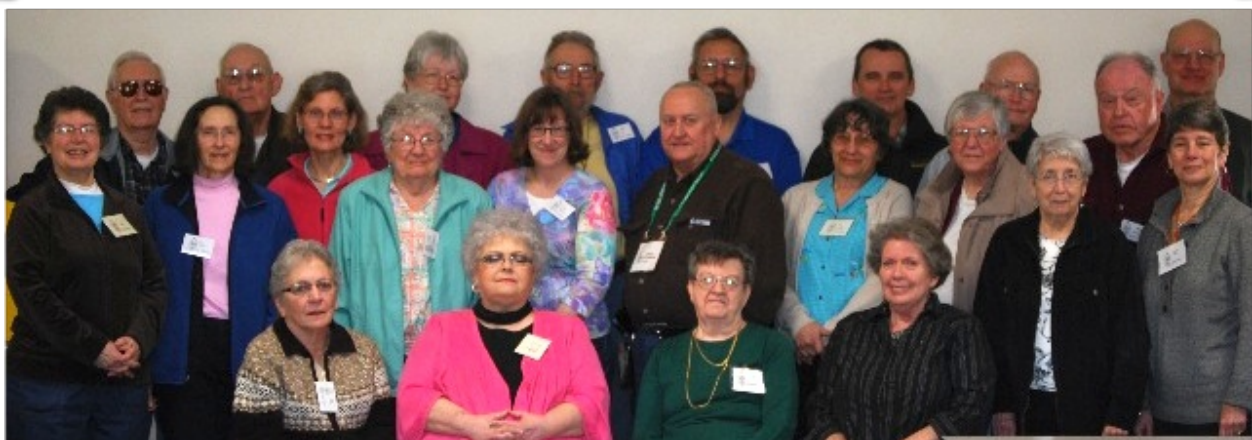
Members, Benton County Genealogical Society, Oregon; March 2013